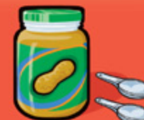
Peanut or nut butters 30 mL (2 Tbsp)