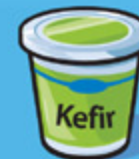
Kefir 175 g (¾ cup)